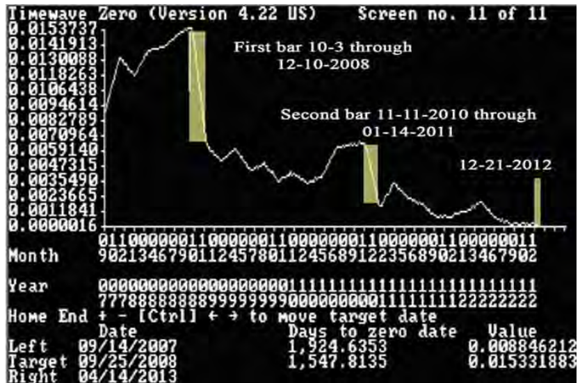
The graph above is from "Time Wave Zero" and covers the period from present through 2012. The first shaded area represent a period of dramatic change from early October 2008 through Early December 2008. This and related work will be discussed in greater depth in the "fall issue" of Global Awakening News.

Will humans reify the old ways of the power of capital and private property? Or will humans find new modes of cooperation with one another and their planet? To what extent will humans reach in to their deeper nature as spiritual beings connected to original Source?